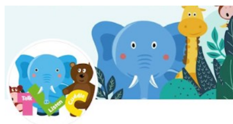
Talk, Listen, Cuddle